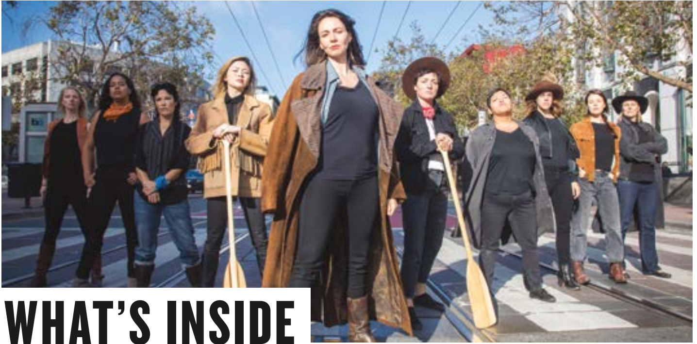
The cast of A.C.T.'s 2018 production of Men on Boats .